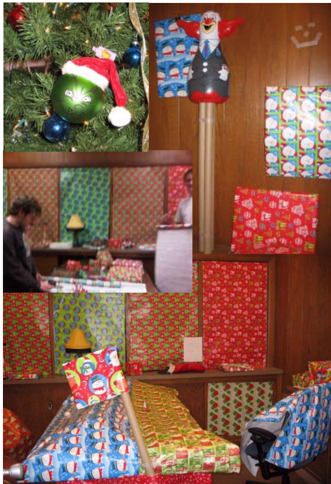
The images of the two elves have been slightly blurred to protect the "innocent."